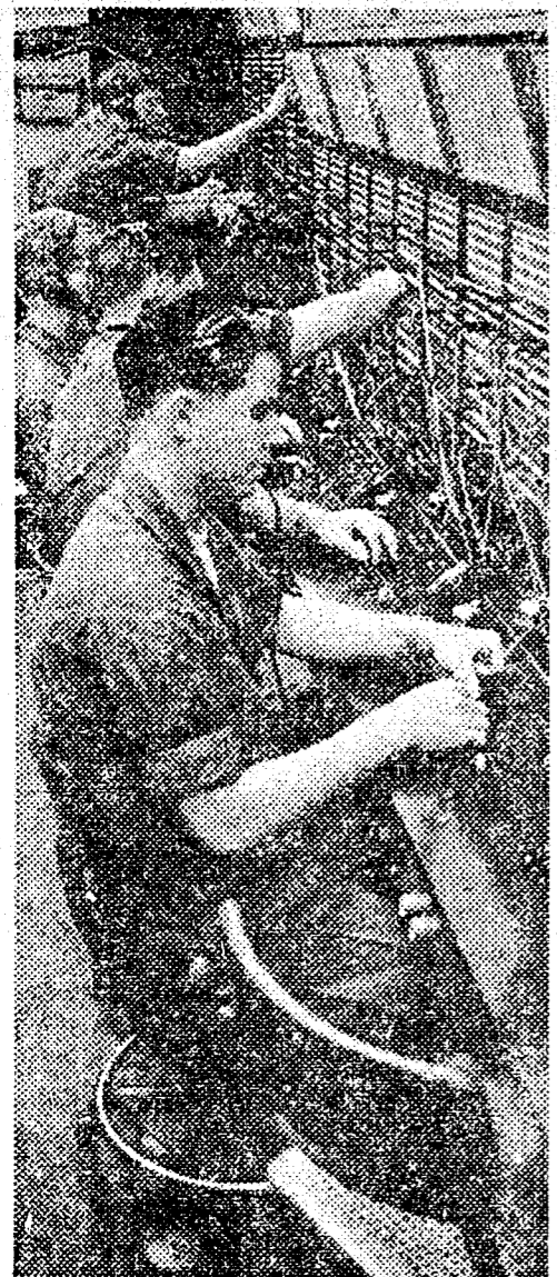
Men of the 69th Signal Bn. man the switchboards in Saigon. They handle more than 26,000 calls a day.

SAIGON—Once the largest battalion in the U.S. Army, the 69th Signal still holds one of