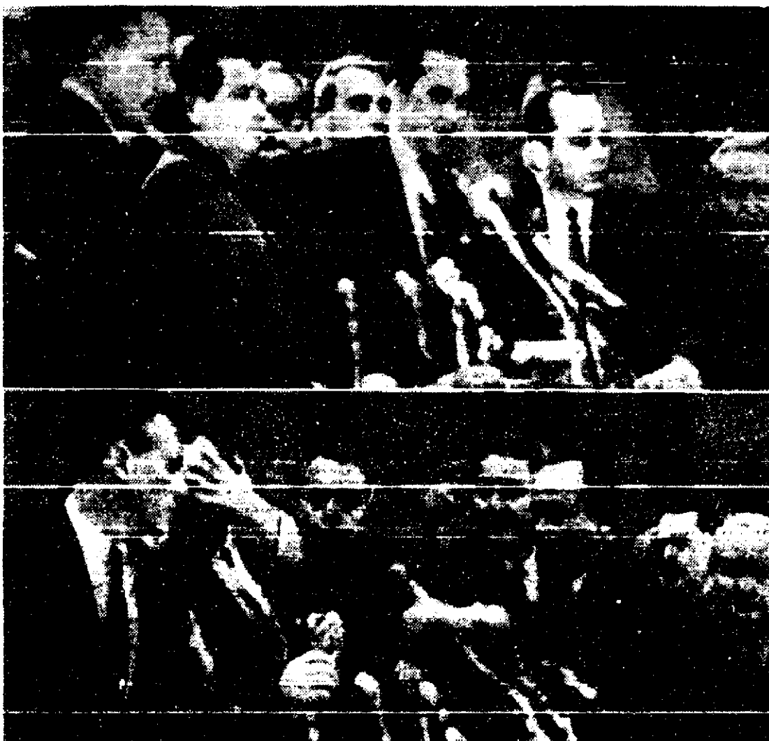
Surrounded by Alabama Highway Patrol bodyguards, presidential candidate George Wallace (center, top photo) begins a speech at the Civic Auditorium in Omaha, Neb. In bottom photo, bodyguards shield Wallace from debris thrown by demonstrators.

SAIGON (AP) — For the first time in the Vietnam war, Viet Cong guerrillas mortared the air base at Cam Ranh Bay Tuesday, but damage was light.