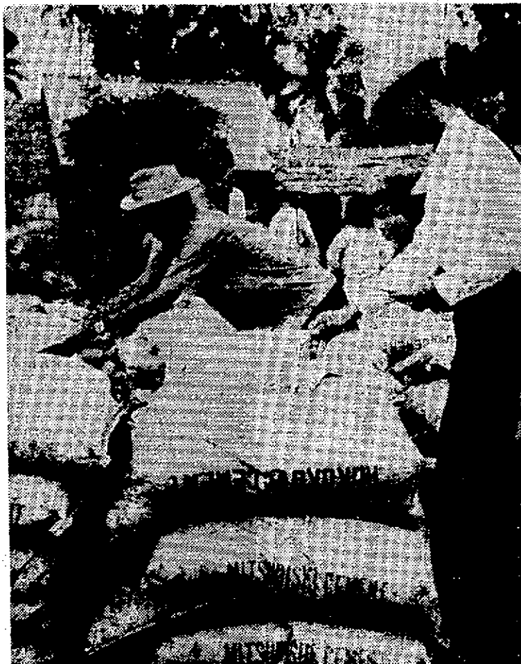
Bags of cement (above) and sheets of tin roofing (below) are given to refugees in Can Tho. Each refugee family receives 10 sheets of roofing, 10 bags of cement and some money to help them rebuild their war shattered homes. The supplies were furnished by the U.S. AID program and the South Vietnamese government.

The destruction and dislocation caused by the Tet offensive has disrupted much of CORDS operations, but gradually conditions are being brought back to a semblance of normal. At any rate, the people working for CORDS don't seem dismayed by the challenge before them.