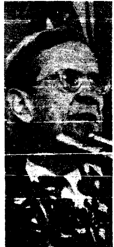
William McChesney Martin Jr., chairman of the Federal Reserve Board, announces agreement on a two-price system to block speculative buying of gold.