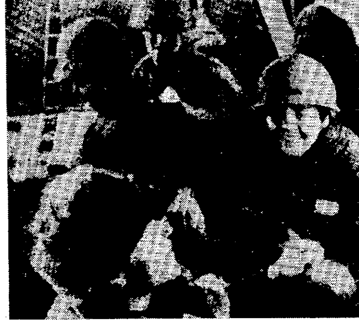
Wheeeeeew! U.S. Marines take cover behind sandbags (top) as the plane they're waiting for is shelled at Khe Sanh. Later, they are all smiles (bottom) at 6,000 feet in the air, far away from the Communist firepower.