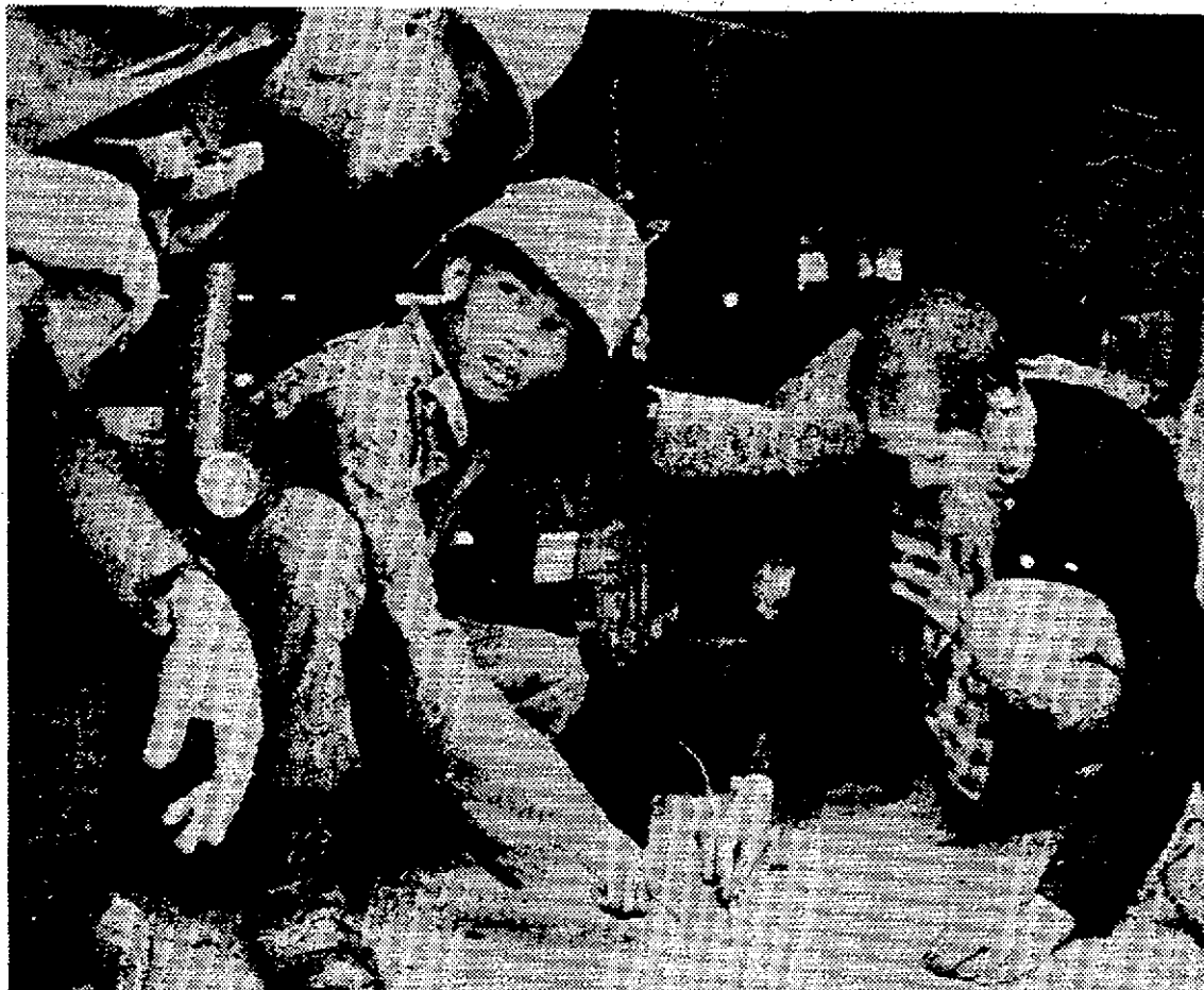
A village elder draws a crude map in the dust in front of his home in a village 15 miles northwest of Saigon. He was answering questions, via interpreter, of a U.S. 25th Inf. Div. intelligence officer (left) on the whereabouts of a Viet Cong group.

SAIGON (AP) — American helicopter gunships wiped out a flotilla of more than 160 Viet Cong sampans resupplying enemy troops in the Mekong Delta near the Cambodian border, the U.S. Command reported Monday. U.S. officials said the volume of arms, munitions and food smuggling, presumably coming from Cambodia along many rivers and canals, has increased considerably in recent days. In the last three days, U.S. gunships and fighter-bombers have smashed 245 sampans laden with arms and food in the canals and rivers of the Mekong Delta.