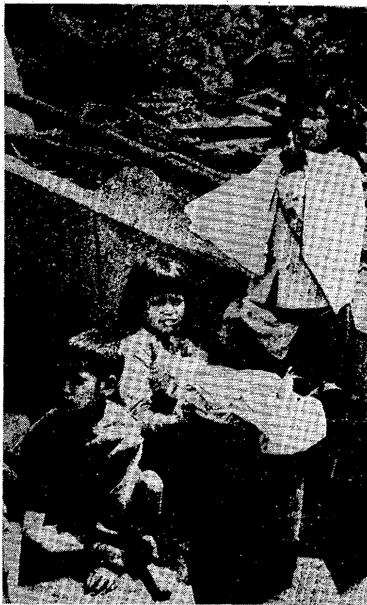
All They Have . . . in a Basket

U.S. officers here said the attack on Trang Bang failed because a battalion of the 23rd Inf. (Mechanized), U.S. 25th Inf. Div. had been deployed near the town before the Viet Cong started their assault.