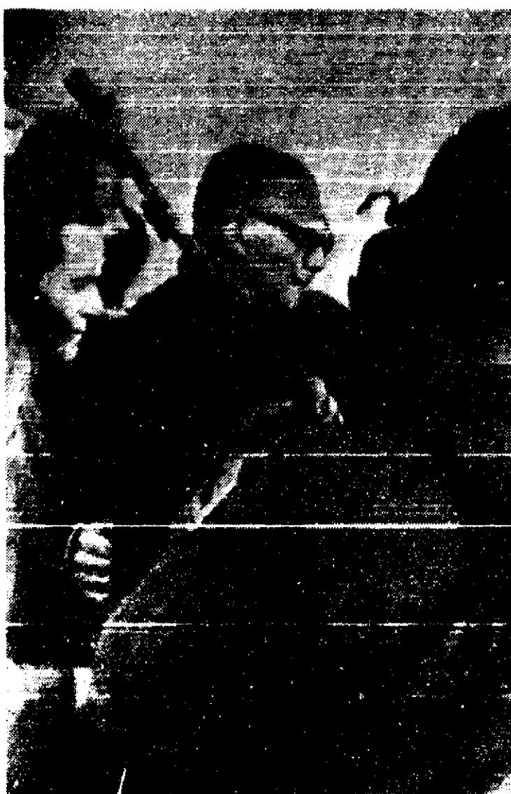
Tear gas cloud rises behind Panama's second president Max Delvalle as National Guardsmen, loyal to President Marco Robles, refuse him entrance to the legislative palace in Panama City.

Vietnamese forces on Operation Truong Cong Dinh reported killing 58 enemy soldiers in three battles in the Mekong Delta Monday.