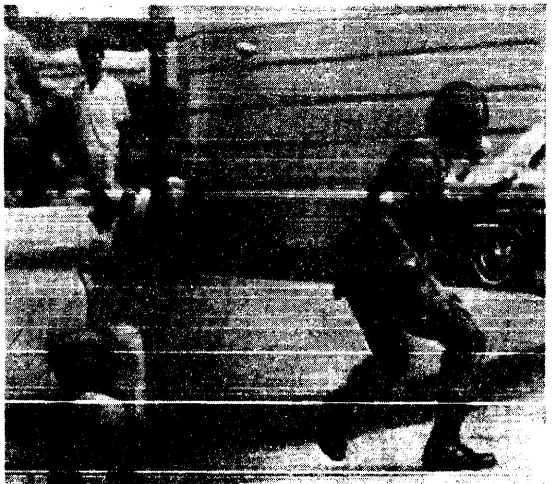
A rock flies at him as a Panamanian national crowd of anti-Robles demonstrators in Panama guardsman starts to hurl a tear gas grenade at a City.

Only scattered light action was reported elsewhere across the country Wednesday.