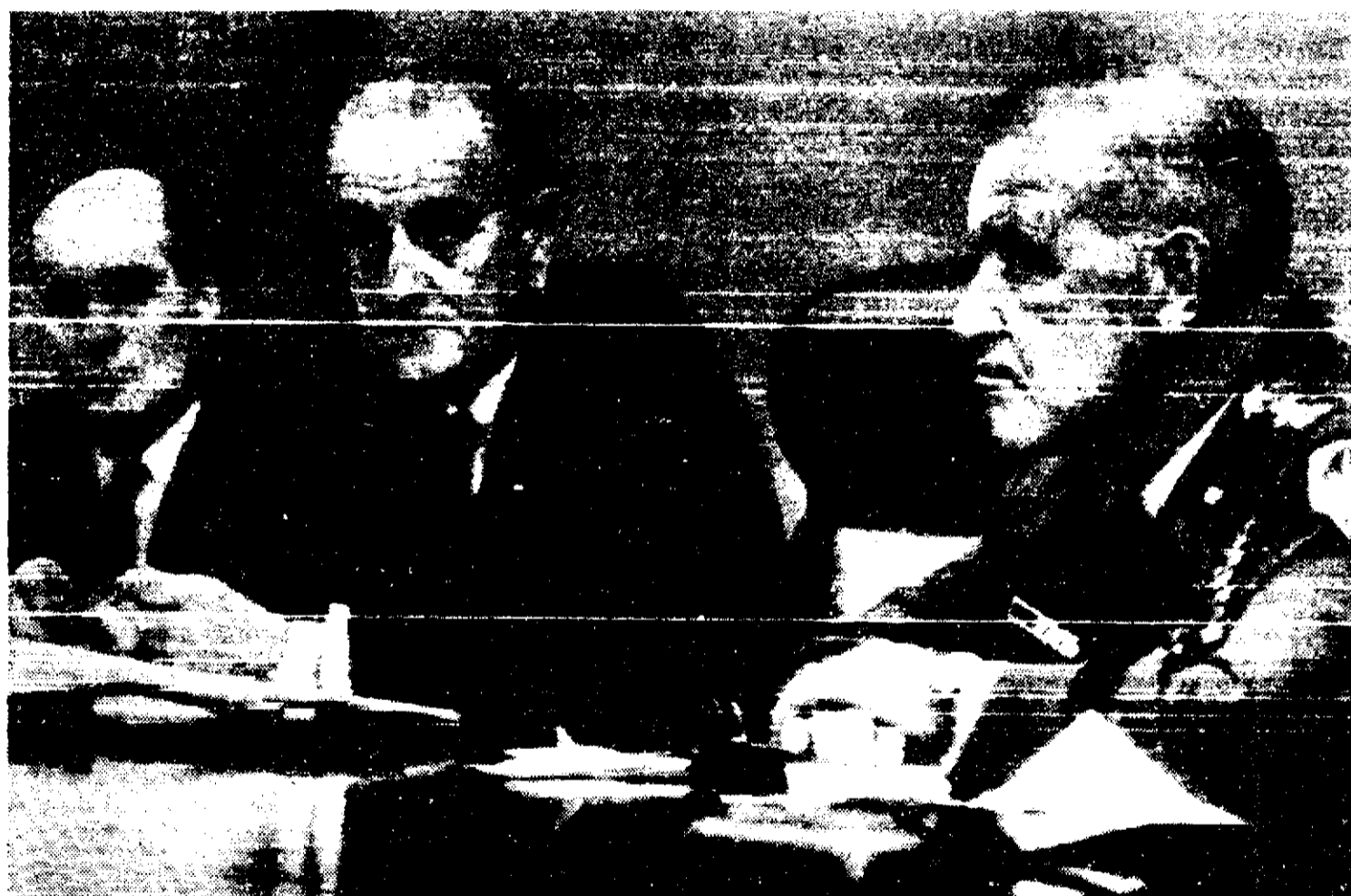
President Johnson and Gen. Creighton W. Abrams listen at a White House meeting of the National Security Council. Abrams is Gen. William C. Westmoreland's top deputy. Behind the President is Undersecretary of State Nicholas Katzenbach.

Abrams, who conferred with the President at lunch Tuesday and again that evening at the White House, joined a meeting (Continued on Back Page, Col. 4)